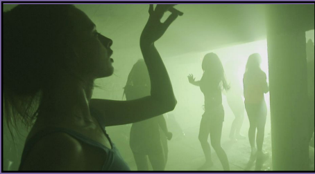
OCT 07 2015 DER NACHTMAHR