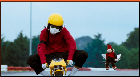
NOV 25 2007 MISTER LONELY

*Content and trigger warnings for all films are available on our website