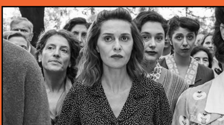
NOV 11 2023 THERE'S STILL TOMORROW