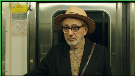
SEP 23 2019 IT MUST BE HEAVEN