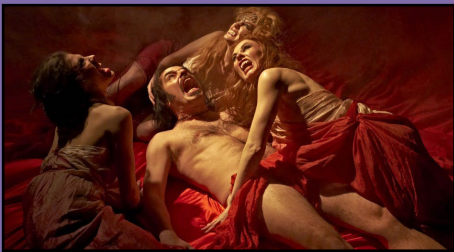
SEP 16 2014 WHAT WE DO IN THE SHADOWS