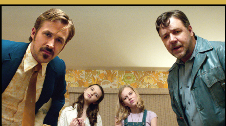
DEC 16 2016 THE NICE GUYS