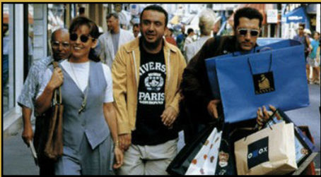
SEP 09 1994 LA CITÉ DE LA PEUR