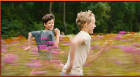
SEP 30 2022 CLOSE