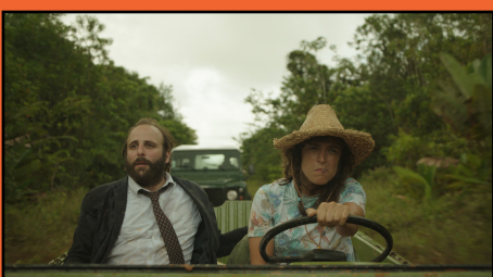
OCT 14 2016 LA LOI DE LA JUNGLE