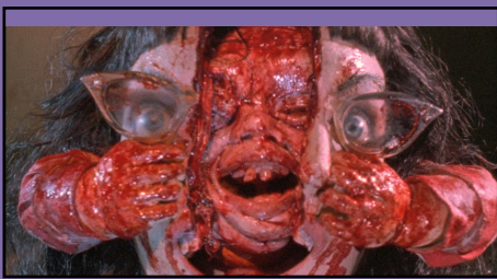
OCT 28 1992 DEAD ALIVE