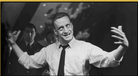
DEC 02 1964 DR. STRANGELOVE